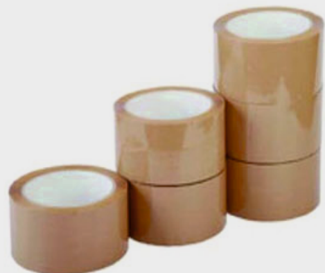
Brown Bopp Tape