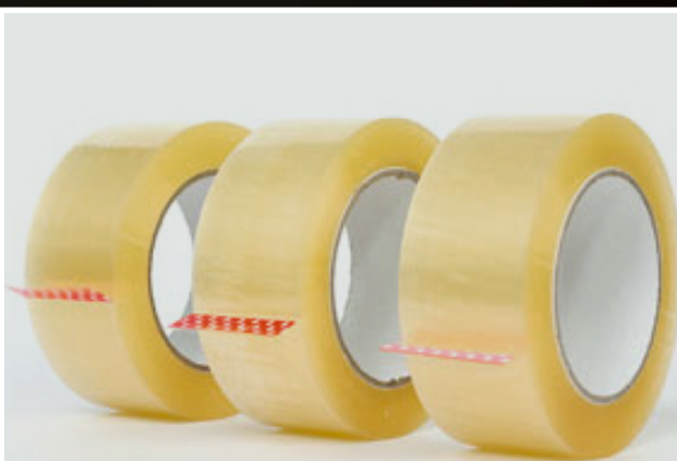
Printed Bopp Tape