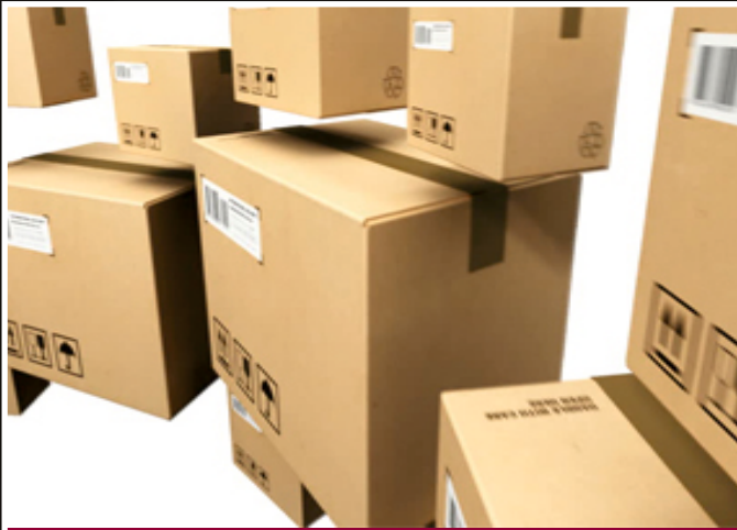
Corrugated Carton Boxes