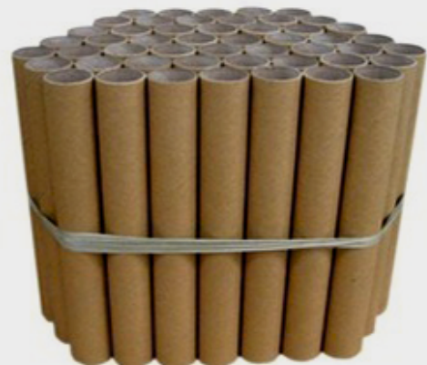
Paper Core Tube