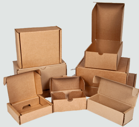
Die Cut Boxes