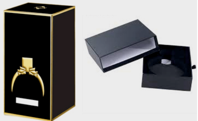
Perfume Inner Box