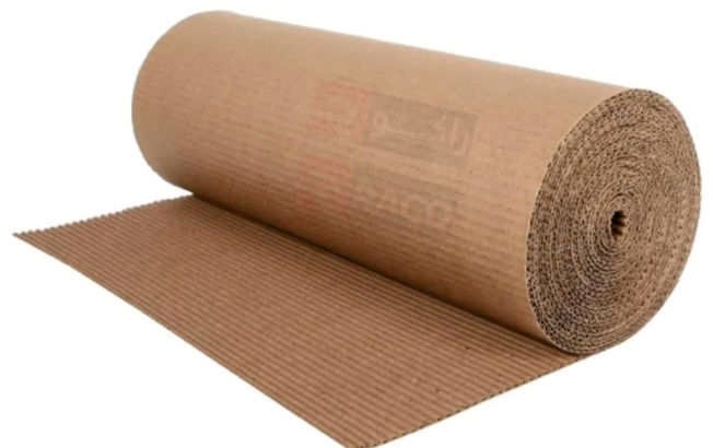
2ply Corrugated Roll